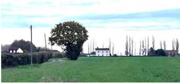
View from Fossets Lane towards Rams Hall Lane (location B on map)