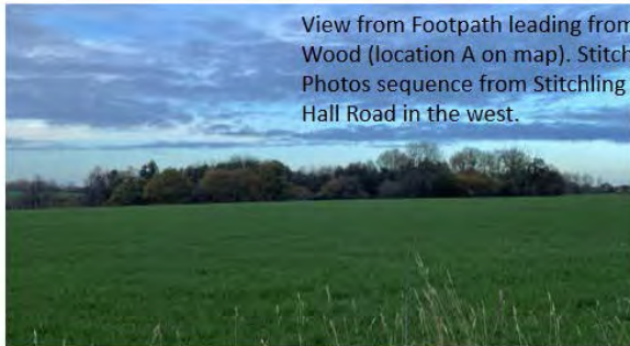
View from Footpath leading from the Old Church towards Hillhouse Wood (location A on map). Stitchling Wood is the larger spiny. Photos sequence from Stitchling Wood in the east to a view of Rams Hall Road in the west.