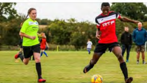
ESSEX.POLICE.UK Back of the net! KickOff@3 brings young people and police together for football fun

Essex Police - Colchester District Published by Heather Turner · 5 October at 17:52 · 🌐 It was great to see Colchester United Football in the Community competing at our KickOffAt3 tournament on Saturday in #GreatBaddow . The players braved torrential rain to give a good account of themselves against opposition from across the county. Altogether, 190 young people had a great day playing football, supported by officers from their local communities. Read more about the day: https://www.essex.police.uk/.../back-of-the-net-kickoff3... #MoreThanCrimeFighters