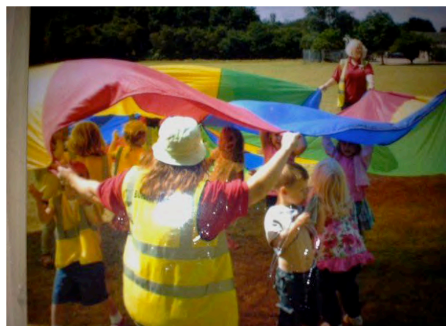
Children from the Bluebells touring the village and playing outside the Orpen Hall