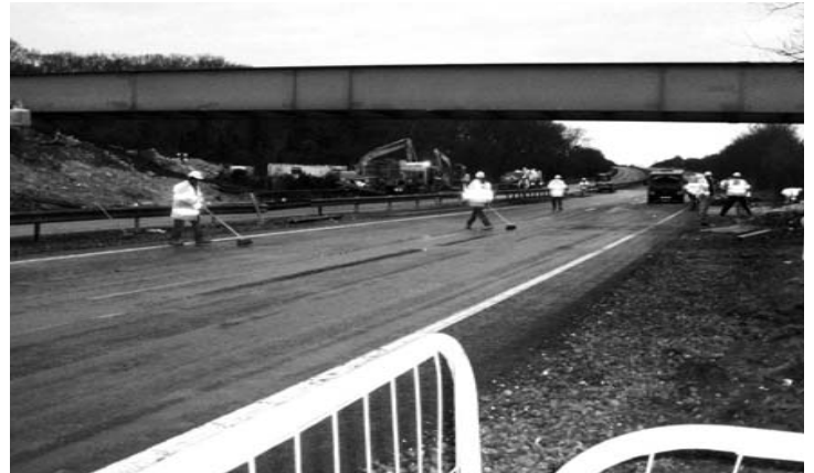
The Final Sweep-up