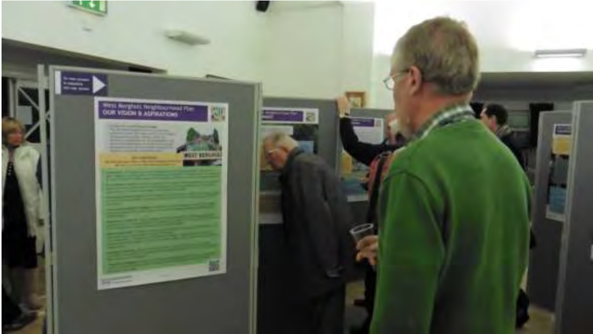
The Issues and Options exhibition