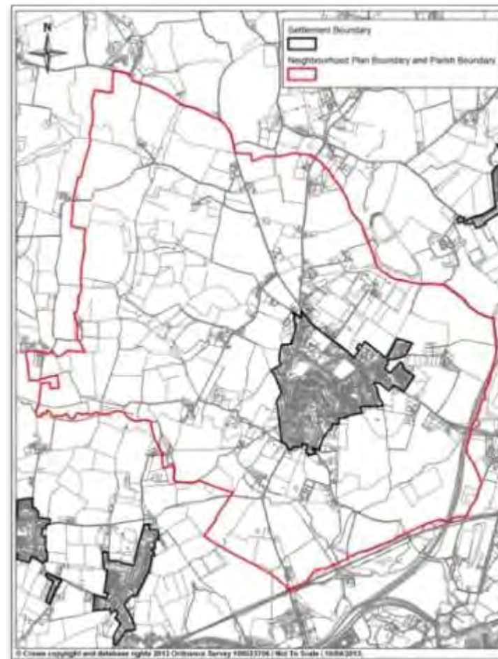
Neighbourhood Plan Area

consultation was held in June 2013. No objections were forthcoming and the plan was confirmed and is shown adjacent: